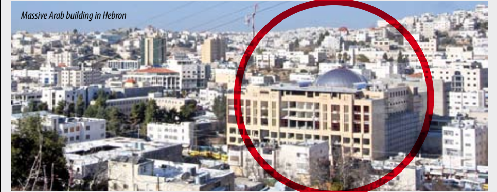
Massive Arab building in Hebron

rescinded its decision to lease to Jews the dwelling units in the Hebron "marketplace," in disregard and repudiation of the request of the owners of the property.