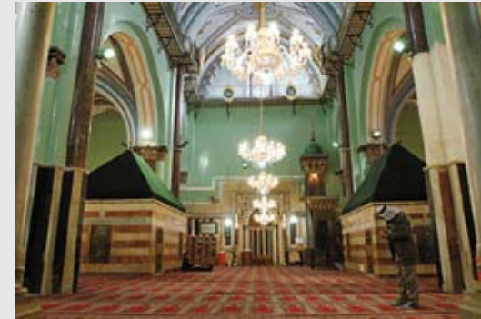
Ma'arat HaMachpela: beautiful Mosque on Arab side, Ragged tent on Jewish side

JEWISH WORSHIPPERS ARE CONFINED TO ONLY ONE - FOURTH OF THE TOMB OF THE PATRIARCHS AREA.