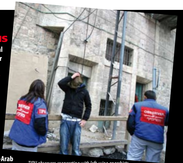
TIPH observers cooperating with left-wing anarchists

For example, the International Solidarity Movement (ISM), a blatantly pro-Palestinian-Arab organization, floods Hebron with "anarchists" from all over the world to harass the security forces that are charged with protecting the Jews in the tiny Israeli zone. Organizations such as Ecumenical Escorters and the Christian Peacekeeping Team, among others, engage in constant provocations and incitement. Groups of antisemitic Christians encourage terrorism and endanger the lives