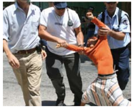
Police dragging away young Jewish girl

For the Arab population, in contrast, the law is chronically under-enforced and applied for show. Usually, lawbreaking by Arabs is dealt with only if it reaches the level of terrorism. Thus, dozens of daily attacks by Arabs against the Jewish inhabitants of Hebron - physical attacks, stone-throwing, sexual harassment, property damage, etc - are ignored. This is the outcome of written procedures from the military prosecutor's office, exacerbated by a shortage of police personnel because nearly all such personnel are pledged to enforcing the law against the Jewish inhabitants. The direct result of this under-enforcement is the denial of the Jewish inhabitants' right to police protection against waylaying, harassment, and miscellaneous attacks.