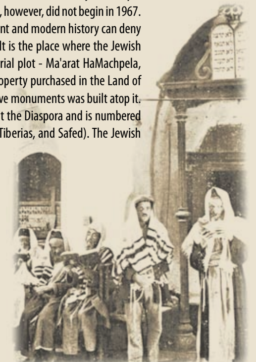
Avraham Avinu synagogue circa 1923

If the Jewish people has undeniable rights anywhere on earth, it is in Hebron. The Jewish community of Hebron today resides on a relatively small fraction of the Jewish property that had been plundered in the 1929 pogrom. This community constitutes the basis and the beginning of the return of Jews to the world's oldest Jewish city.