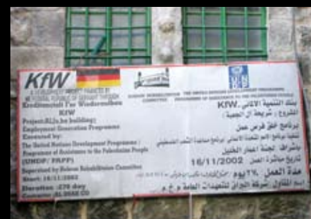
German / EU investments in Arab Hebron ventures

The Association for Civil Rights in Israel (ACRI) recently joined the activities of the Left in Hebron, acting continually by legal means to breach and trample the Jewish citizens' rights to life and safety.