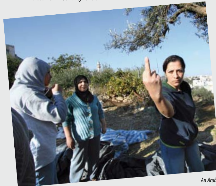
An Arab woman from Tel Rumeida gesturing to Hebron Jews

THE JEWS ARE ALMOST TOTALLY DEPRIVED OF THEIR PROPERTY RIGHTS.