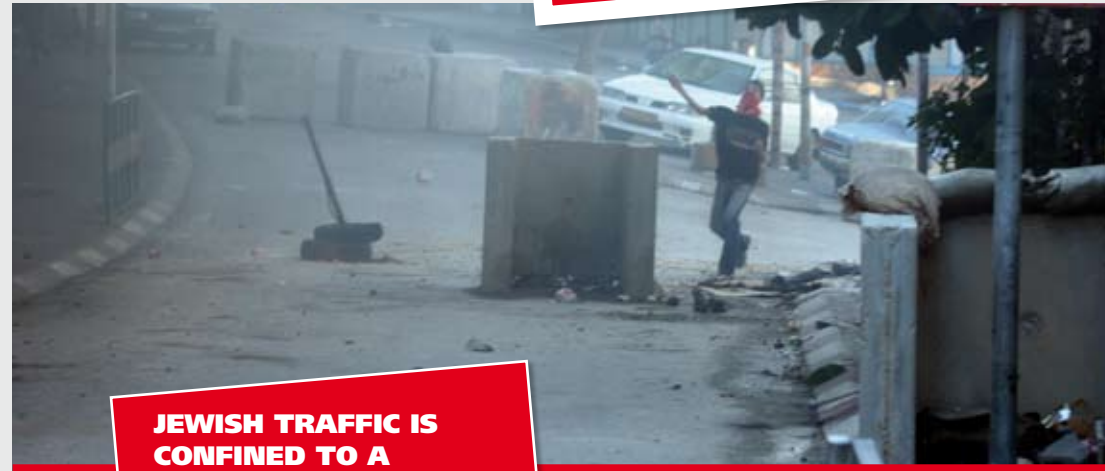
Arab hurling fire-bomb at soliders in Hebron

JEWISH TRAFFIC IS CONFINED TO A MINUSCULE AREA AND TO ONE STREET